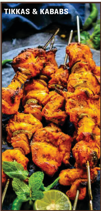
TIKKAS & KABABS