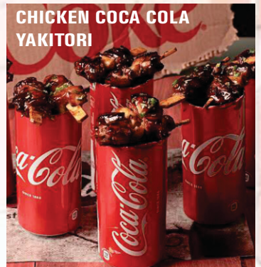
CHICKEN COCA COLA YAKITORI