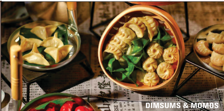
DIMSUMS & MOMOS

indian ITALIAN MEXICAN LEBANESE CHINESE THAI JAPANESE BURMESE