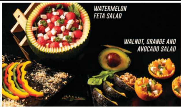
WATERMELON FETA SALAD